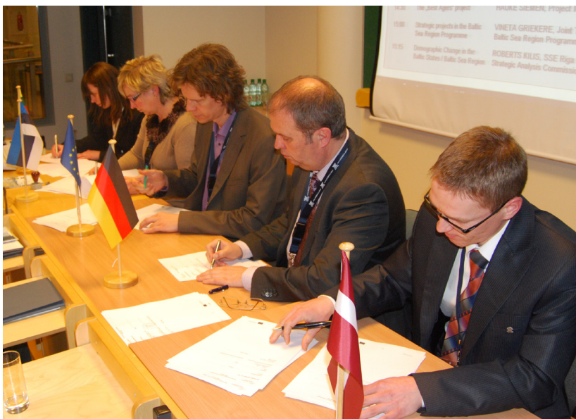
The Partners signed the Partnership Agreement in Riga to document their commitment to the project.

Is your best ager-activity missing on the list? Send an e-mail to bestagers@rem-consult.eu .