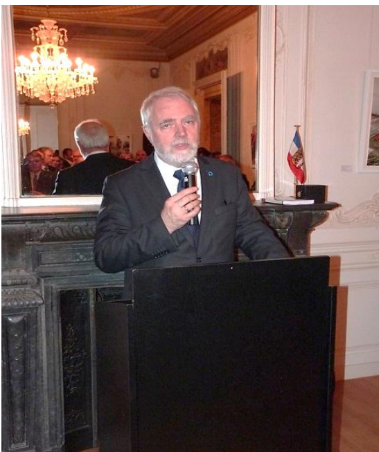
Jan Olbrycht, MEP

The Baltic Sea region finds itself in fierce competition with other regions of the world to attract businesses and skilled workers and to create prosperity. Regional policy seeks to strengthen the competitiveness of the Baltic Sea region, and the EU Baltic Sea Strategy is an example for these efforts. But they are insufficient.