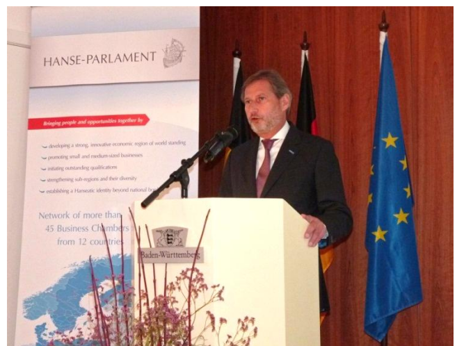
EU Commissioner Hahn at the meeting in Brussels

At a reception in the Hanse-Office, the strategy programme "Innovation in Regional Policy" was