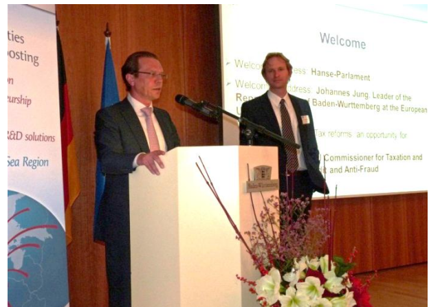
EU Commissioner Šemeta and Max Hogeforster

The Hanseatic-Parliament is an association of 50 chambers of commerce, industry and crafts as well as other SME supporters from the entire Baltic region. The members serve a total of approximately 450,000 small and medium enterprises. The aim of the Hanseatic-Parliament is to promote medium-sized companies and to strengthen the competitiveness of the Baltic Sea region.