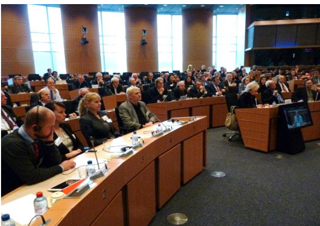
Project partners meeting in the European Parliament

Initial but tangible work has already begun: Training programmes on corporate social responsibility and energy efficiency have been developed and run, and a project to promote the participation of women and senior people in work life is being conducted.