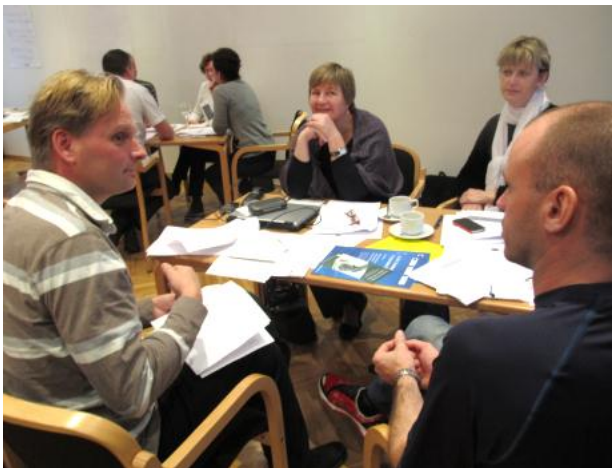
Seminar in Riga

After one year project running time we can now announce developed Train-the-Trainer training series for VET school teachers and mobility coordinators. These trainings will be carried out in Latvia, Estonia, Sweden and Lithuania, where more than 300 VET teachers and mobility coordinators will be qualified to support and guide (especially international active) VET students towards entrepreneurship.