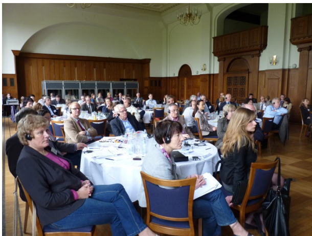
Hanseatic Conference 2012 in Hamburg

The complete results of the Hanseatic Conference will be published in a book to appear in the publication series of the Baltic Sea Academy. On its basis the Hanseatic Parliament will develop the political strategy "Innovation in Regional Policy for the Baltic Sea Region" that will be presented in November this year in Brussels.